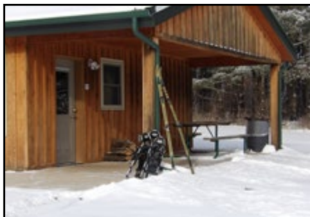
Cabins are available year-round. Winter is a great time for a cabin stay! Ask to borrow a pair of snowshoes.