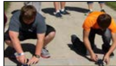
Boys trying solar cars

Through their design, assembly and testing of solar cars, wind turbine blades and solar ovens, students learn skills in engineering, problem solving and renewable energy concepts. Limited Materials are available for loan, and possibly from your local AEA. Kits and/or components can also be purchased online.