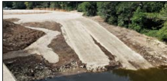
The footprint for upgrades at Iron Bridge Access can be seen now. Work is expected to be completed this spring.

Major funding for this project was made possible with competitive grants from Iowa's Water Recreation Access Cost-Share Program, Wellmark Foundation, Black Hawk County Gaming Association, Buchanan County Community Foundation, and Tri-Rivers Waterfowlers. For more information and updates on progress, visit www.buchanancountyparks.com.