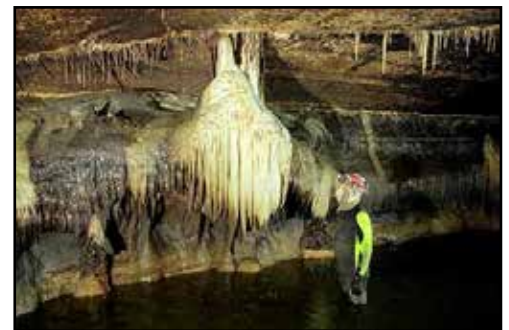
One of Coldwater Cave's many formations

Wet suits, helmets, and neoprene socks are provide for a trip into Iowa's longest cave. This adventure involves walking in knee- to waist-deep water, and is dependent on weather and water level conditions (refunds will be given if the trip is canceled). The entrance is a 100 foot ladder going down a shaft into the cave. Getting back up is somewhat difficult. Please assess your physical