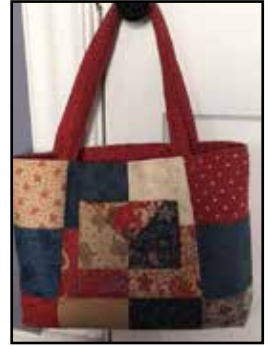
*Bag will be Denim