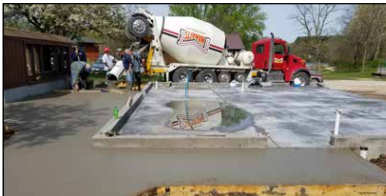
Left: In early May, workers from Klever Concrete pour the floor and sidewalks for the new Wildlife and Animal Care Building at Fontana Park.