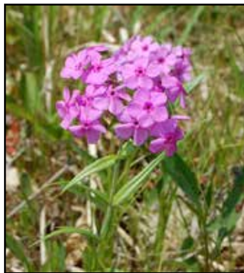
Prairie Phlox bloom from May to July

Buchanan County Roadside is excited about starting a new Facebook series of "What's in our ditch?" Throughout the summer we will be posting pictures of the vegetation and animals that are growing and living in the ditches of Buchanan County.